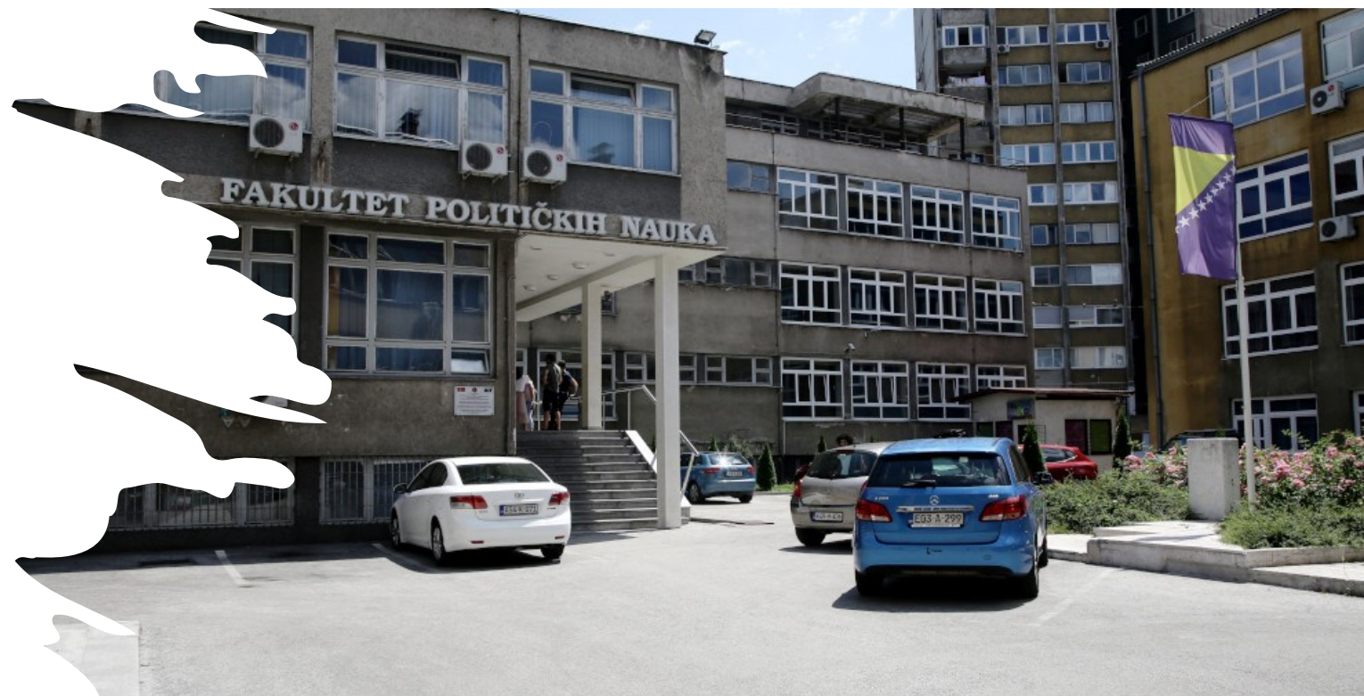
UNIVERSITY OF SARAJEVO – FACULTY OF POLITICAL SCIENCES